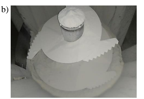
Fig. 1. General view of the "Braclav" machine for preparation and distribution of feed (a), and an auger with knives of the grinding-mixing mechanism (b) in the production

Improvement of the mechanisms for preparing and distributing feed in modern conditions is carried out in the directions of introducing multifunctionality of machines; improvement of constructive and technological characteristics; increasing the durability of the working bodies; expanding the capabilities of electronics in monitoring the technical condition and controlling the technological processes of the machine. In addition, the assessment of the influence of a human operator upon the reliability of the use of equipment becomes very important.